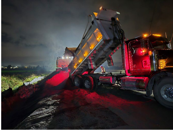
Figure 1: A truck unloading soil overnight along Highway 99 in Richmond (October 2024).