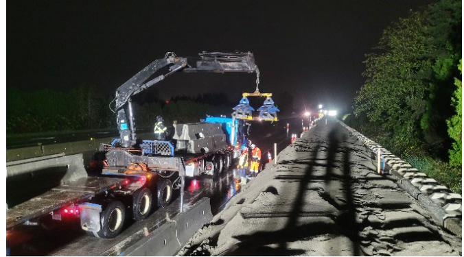
Figure 2: Installing concrete barriers along Highway 99 in Richmond to contain the preload material (October 2024).