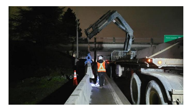
Figure 1: Crews move concrete barriers into place along Highway 99 in Richmond to contain the preload material.