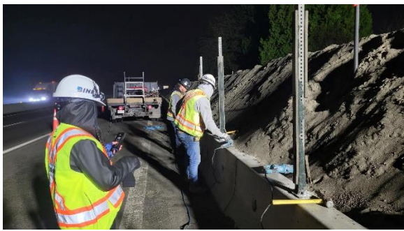
Figure 2: Crews inspect preload material along Highway 99 in Richmond.